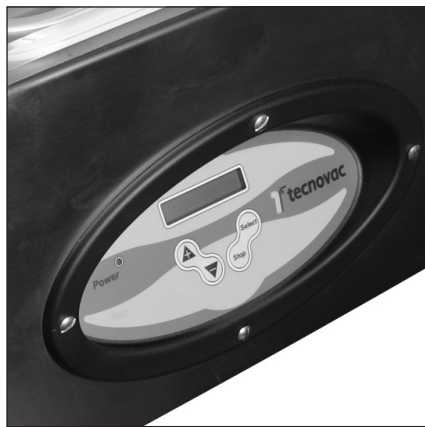
The Tecnovac control panel

The Tecnovac range of bench-top vacuum packaging systems are specially designed for efficient and economic packaging and sealing of a wide range of perishable foods. The machines are ideal for restaurants, delicatessens, small goods manufacture, butchers, and catering companies.