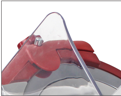
The built-in sharpener is simple and safe to operate.