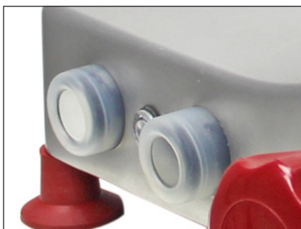
Simple, low-voltage switches turn the 250IX on and off.