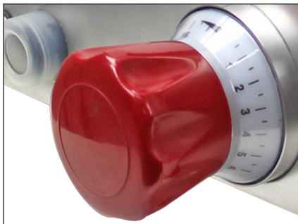
Precision slicing with the micrometric slice thickness knob.