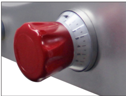
Precision slicing with the micrometric slice thickness knob.