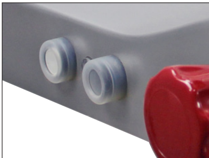
Simple, low-voltage switches turn the 350IX on and off.

The heavy duty Model 350IX Gravity-feed slicer has been designed to handle meats of all kinds.