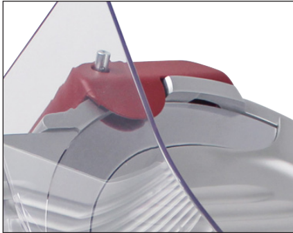
The built-in sharpener is simple and safe to operate.